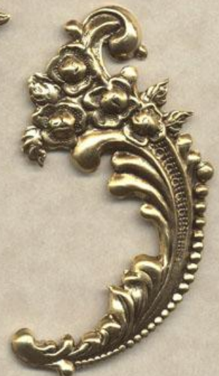
3540-1 COL: 1,2