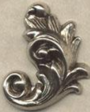
4164 COL: 1,2