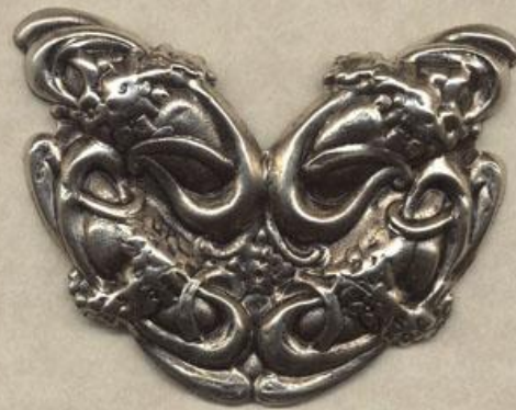
5146 COL: 1,2