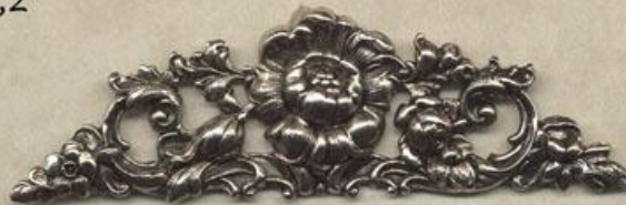
7541-A COL: 1,2