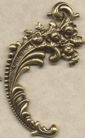
1543-1 COL: 1,2