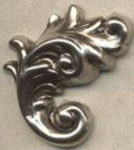
4163 COL: 1,2