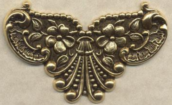
0027 COL: 1,2,4,5