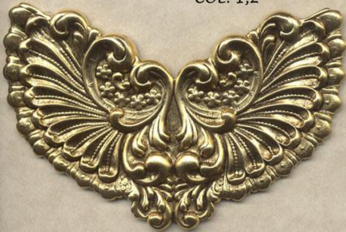
1233 COL: 1,2