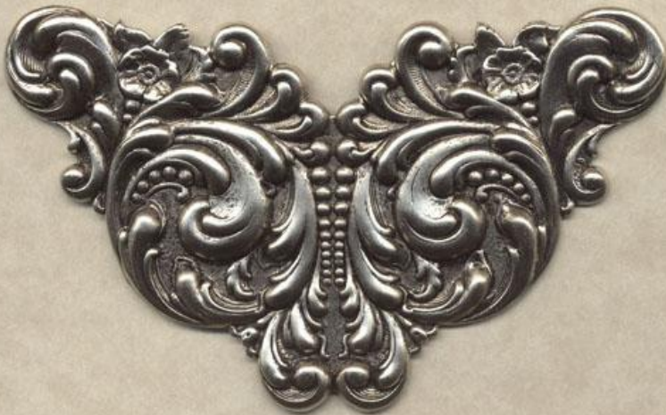
999A COL: 1,2

COL : 1 ANT GOLD OX COL: 2 ANT PEWTER OX COL: 4 BRIGHT GOLD COL: 5 WHITE NICKEL